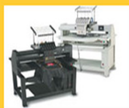
TABLE TOP MODEL